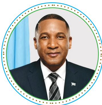
President Advocate Duma Gideon Boko President of Botswana